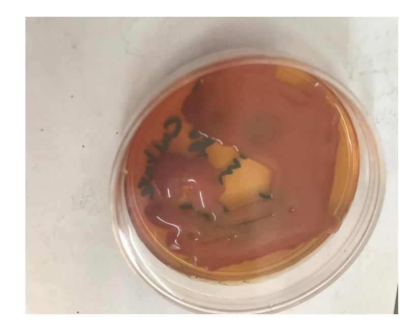
Figure 1: Klebsiella on MacCkonkey agar