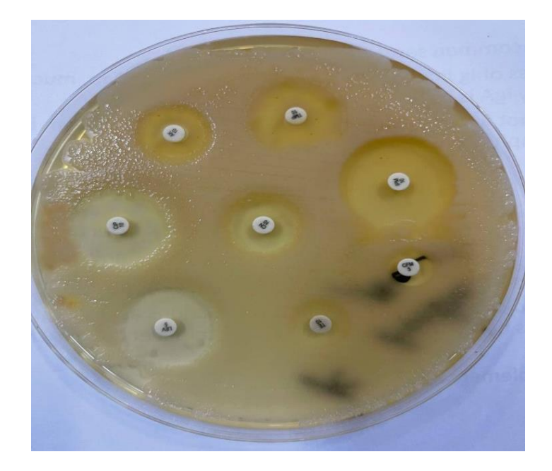
Figure 2: Antibiotic susceptibility test shows the resistance of Klebsiella against different antibiotics

Results of antibiotic susceptibility of our isolates are summarized in Table-2. According to the results of the Kirby-Bauer method, the highest percentage of resistance was against Cefixime and Trimethoprim (100%), while the lowest bacterial resistance was against Ciprofloxacin, Levofloxacin, and Imepenem (28.57%) as shown in Figure-3.