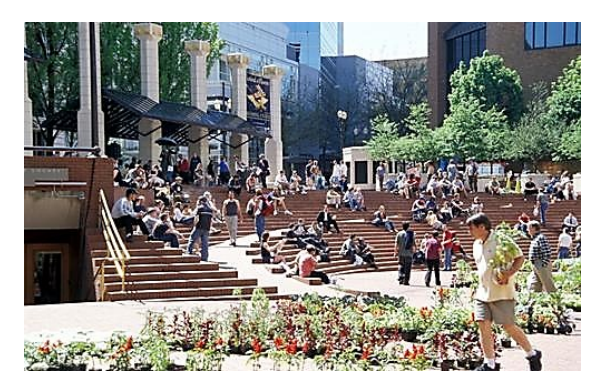
Fig. (2): Show space vitality in center

traffic pathways are the trend that represents the basic stage of adaptation to the environment show in Fig. (2). to mitigate the effects of harsh climate and mitigate the effects, especially high temperature and solar radiation and dusty and warm winds and thus reduce the total thermal impact on the facades of buildings, especially residential units [13].